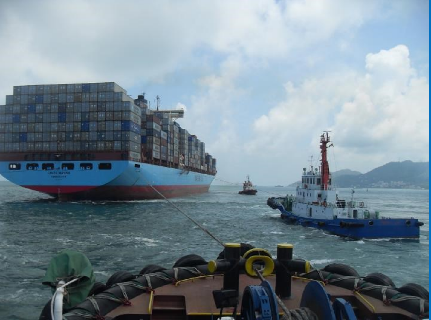
Rescue Agrounding ship