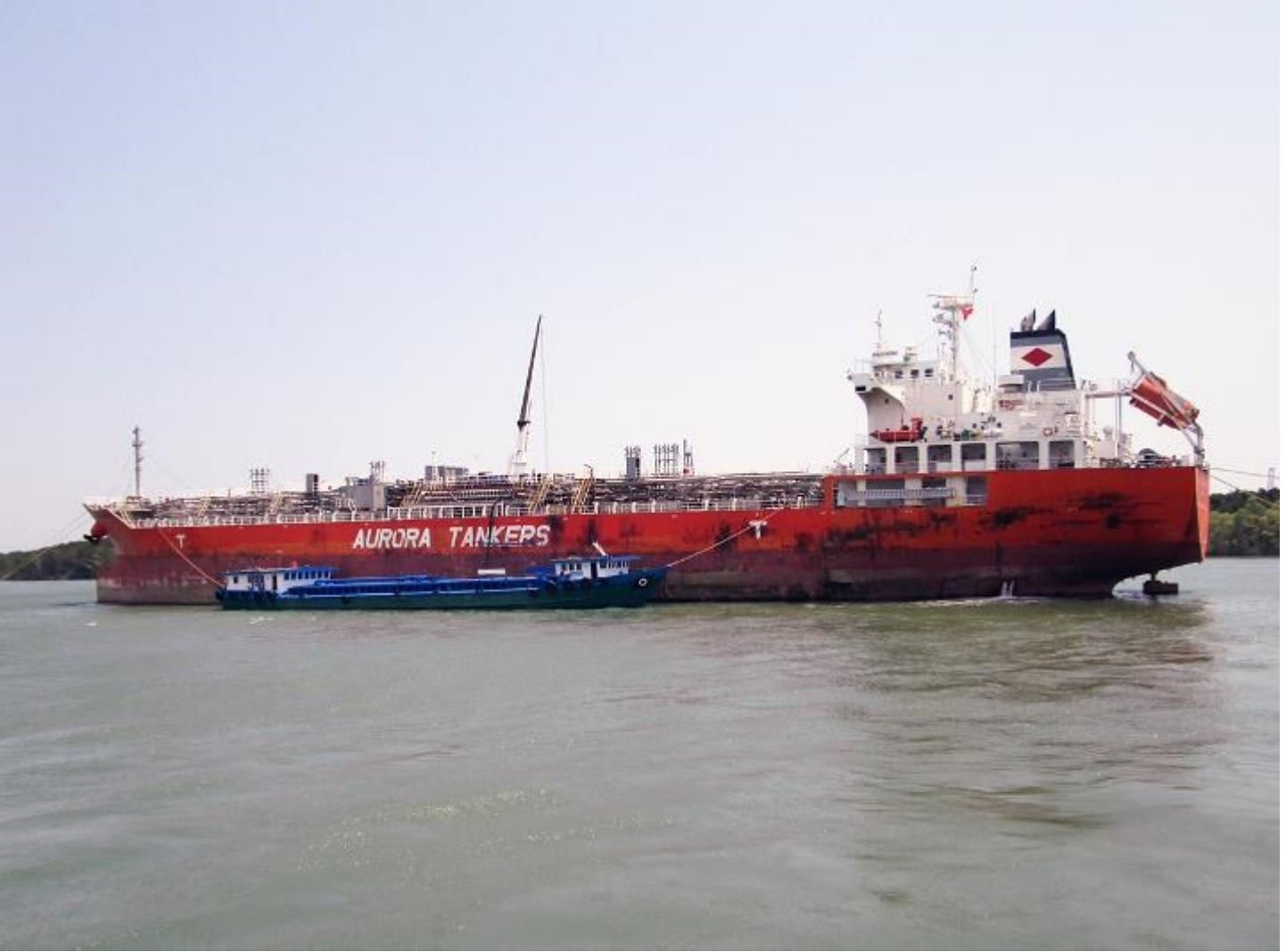
LIQUID PRODUCTS TRANSPORTATION BY BARGE