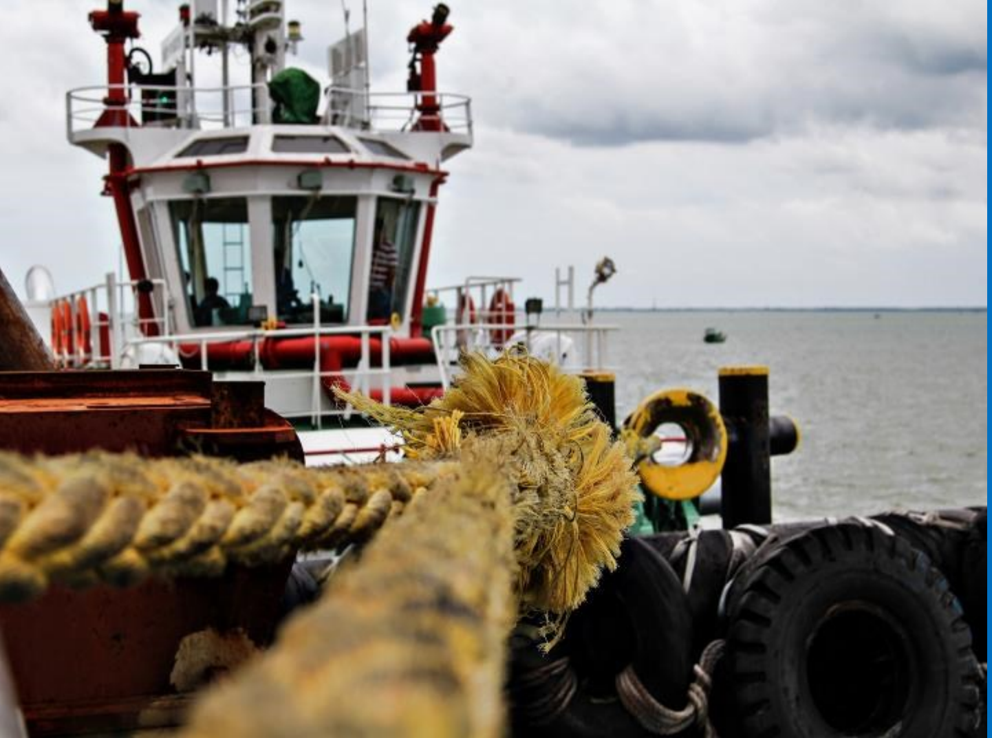
HEAVY MACHINERY TRANSPORTATION BY BARGE