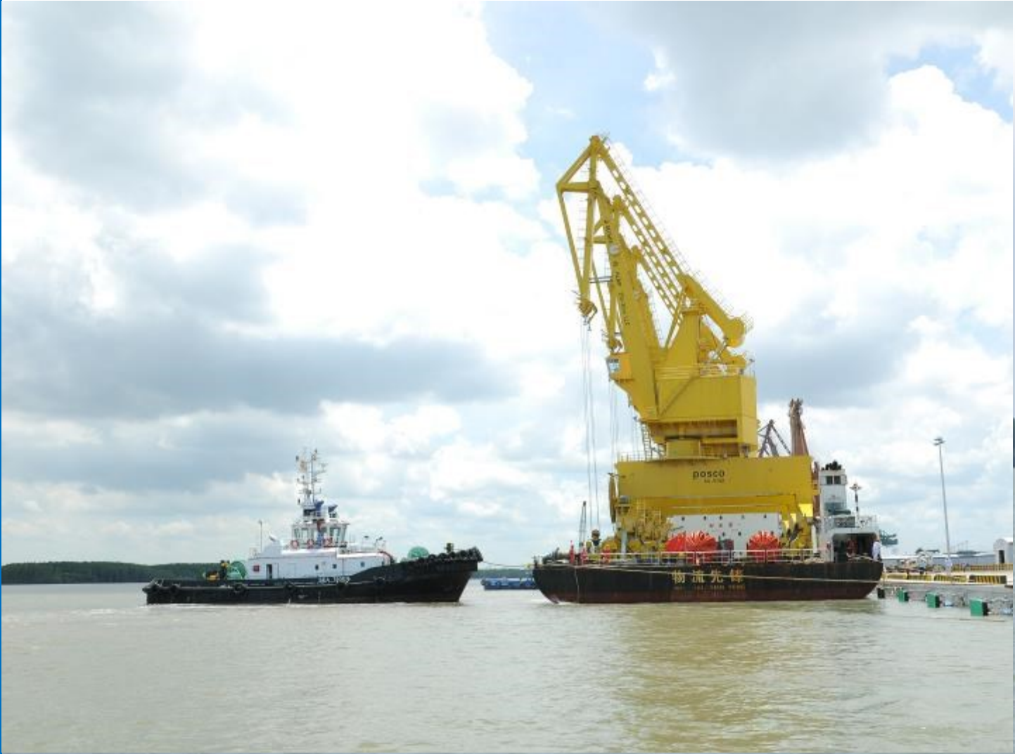
HEAVY MACHINERY BARGE TRANSPORTATION