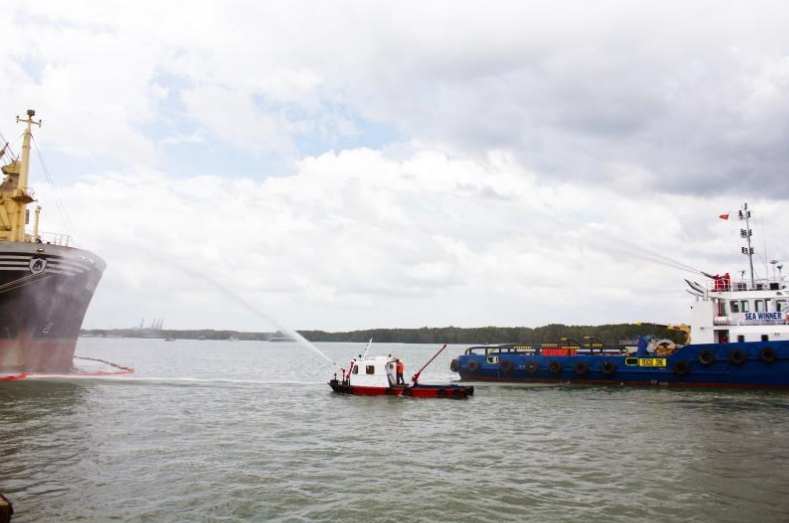
Fire - fighting