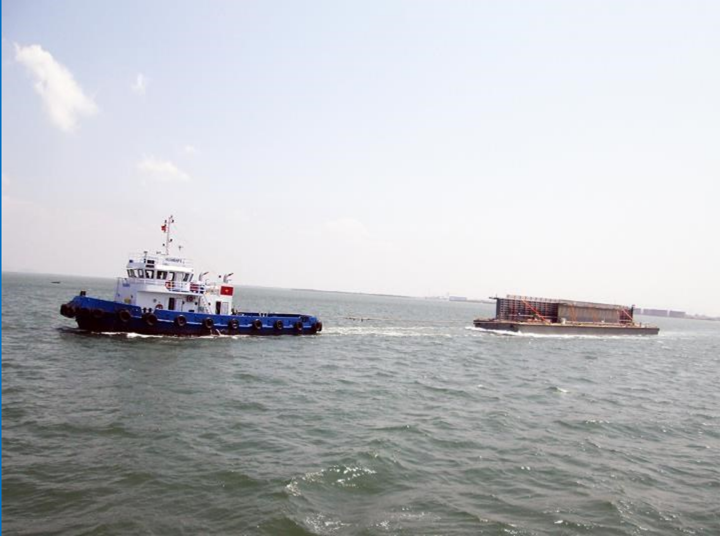
HEAVY MACHINERY TRANSPORTATION BY BARGE