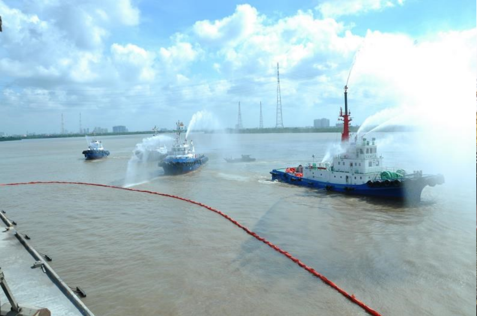
Fire - fighting