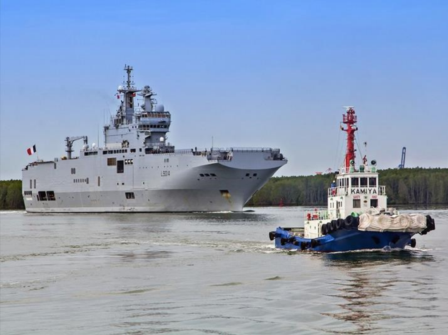
ESCORTING, CLEARANCE FAIRWAYS IN NARROW CANAL