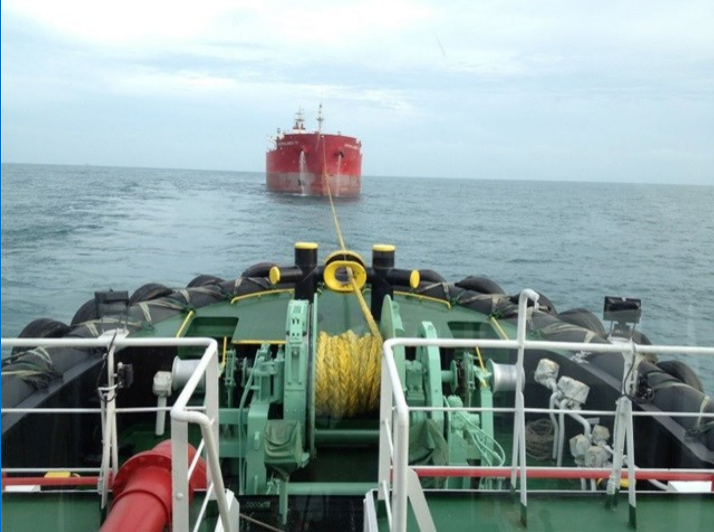
Towing Main Engine failed